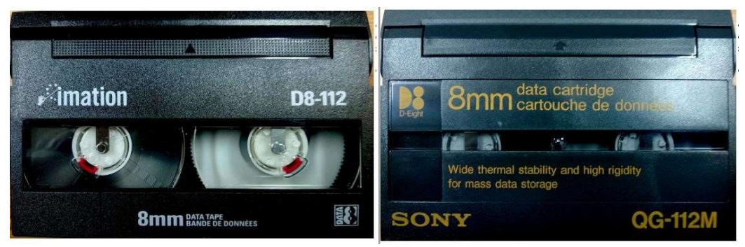
Fig 02: 8mm (Exabyte) tape cartridges