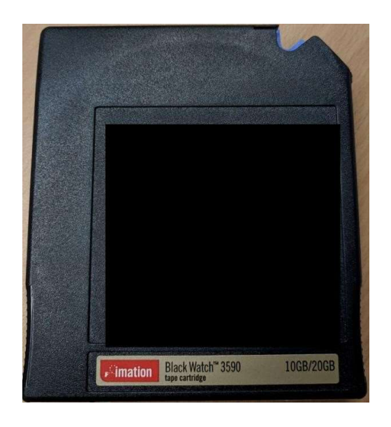
Fig 01: Imation Black Watch 3590 (J) Tape

Subsequently the marine geophysical lab at NCPOR is contains some amount of geophysical data in SEG-Y format.